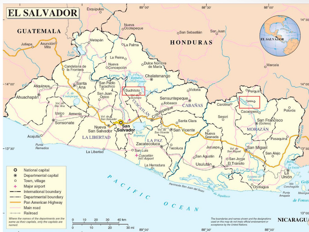
Figure 1. Map showing key research sites.