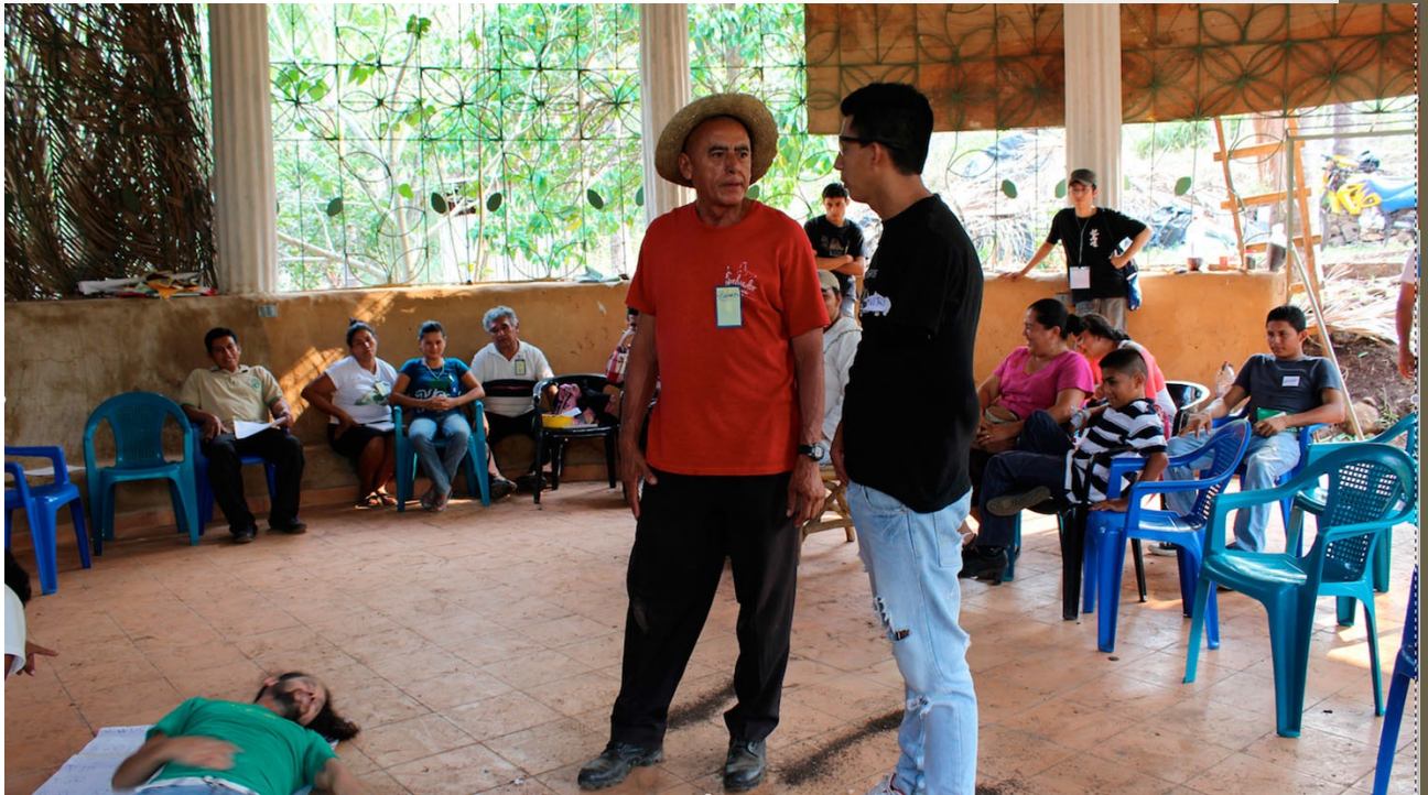
Figure 3. "The soil has died".