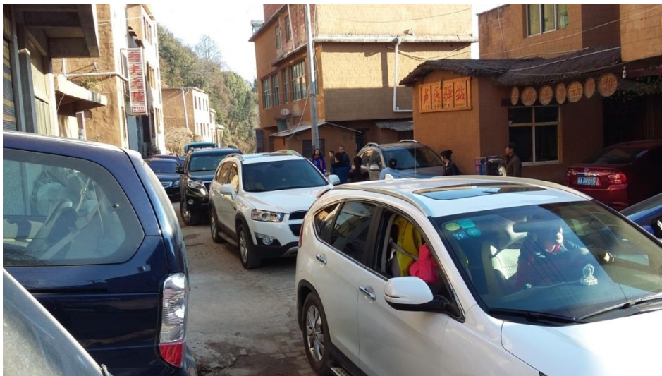
Figure Six: Car traffic at 8am in Duoyishu village (local pop.4,000)

by the government. In effect, the Hani derive no direct benefits, unless they lease their house for renovation and development into guest houses and hotels. Some Hani women work in the restaurants and hotels as kitchen or cleaning staff. Many men work in construction, feverishly building new accommodation, eateries and car parking facilities; not easy enterprises on the 45 degree slopes at 2,500 meters. Today, most tourists come by car and car traffic is a constant problem for all concerned. At some point it will probably become necessary to park cars in outside car parks and transport tourists to the favoured sites by public vehicles, as is common practice in other mass tourism sites in China.