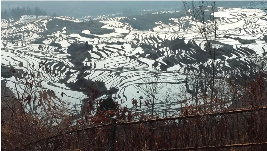
Figure Two: Early morning rice terrace landscape, Yuanyang County, January, 2016.

At first, because of its remote location, only photographers and eco-tourists found their way to the Hani rice terraces. There was only one hotel in Yuanyang when I went there in 2009, but now assisted by aggressive tourism businesses and a helpful local authority, there are over 50 small hotels and over 50,000 tourists that make the trek to South Yunnan to see the Hani terraces ( Figure 3)