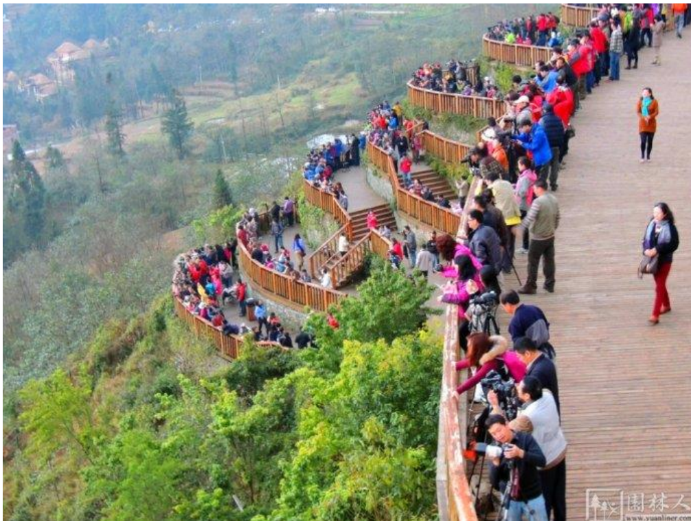
Figure Five: One of four viewing platforms in Yuanyang County, 2016

Nb, people are charged a fee when entering the viewing platform.